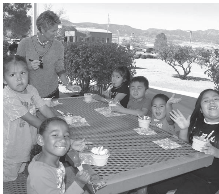
A special healthy yogurt ice cream treat before Zumba!