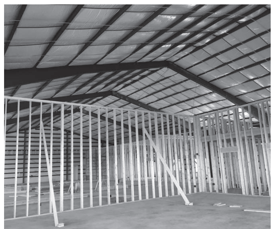
Wall partitions being installed inside of the Tunlii community center.