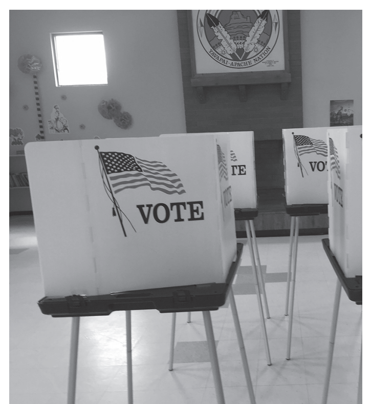
Voting booths for upcoming election on September 16 to be held on the Yavapai-Apache Nation.